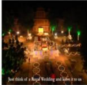
Just think of a Royal Wedding and leave it to us