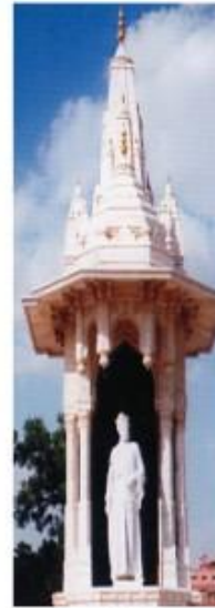
Impressive Marble Statue of Maharaj Sri Lal Singhji of Bikaner